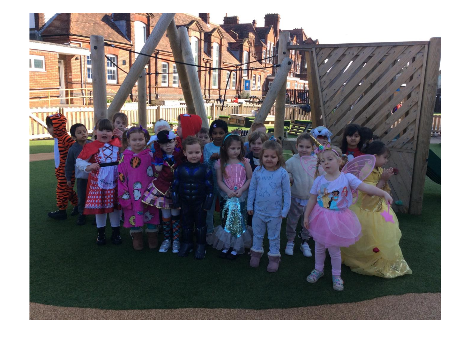
They all lived Happy ever after!