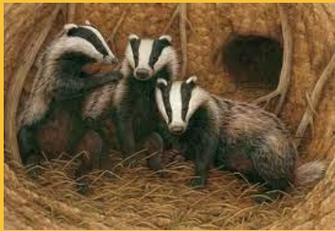
badgers in a sett