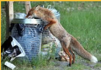
urban foxes are scavengers